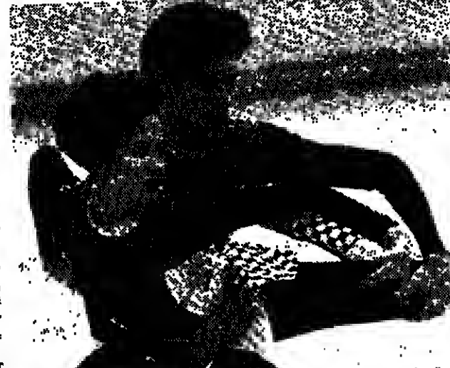
Punsalan and Swallow said they still planned to go to Lillehammer.

Punsalan and Swallow, who live in Pontiac, Michigan, are two-time U.S. Ice Dance Champions for 1991 and 1994. They were married in September.